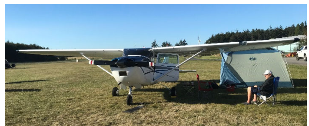
A 574 sunset

Even an 87 year old guy can have fun camping, given a comfy airbed and having electricity available for those creature comforts! It'll be one of those memorable trips for years to come!