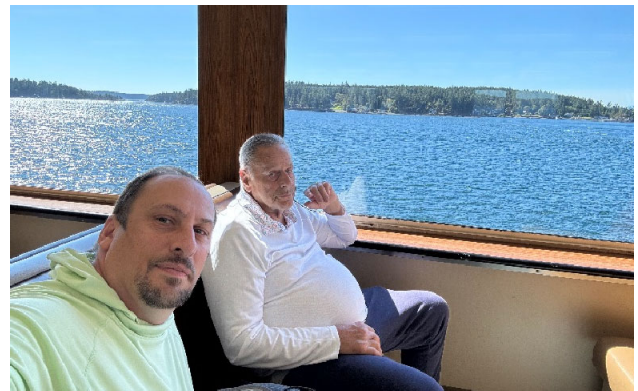
Dad and I on the ferry to San Juan Island

For a change of pace, we took the state ferry to San Juan Island via Friday Harbor - we just had to grab a taxi to the Orcas Island Ferry Terminal. Passenger walk-on's are free for inter-island connections. Once at Friday Harbor, we took the shuttle to Roche Harbor for a tour and lunch. Back to Friday Harbor found us sightseeing and having dinner. And early evening had us taking the ferry back to Orcas.