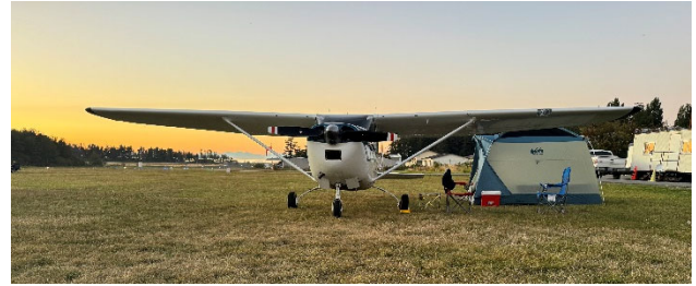
574, the tent, and dad

This was my dad's first visit to the islands and I think he liked it! We camped at Orcas Island Airport under the wing of 574. We ate predominantly in Eastsound, hiking into town for each meal.