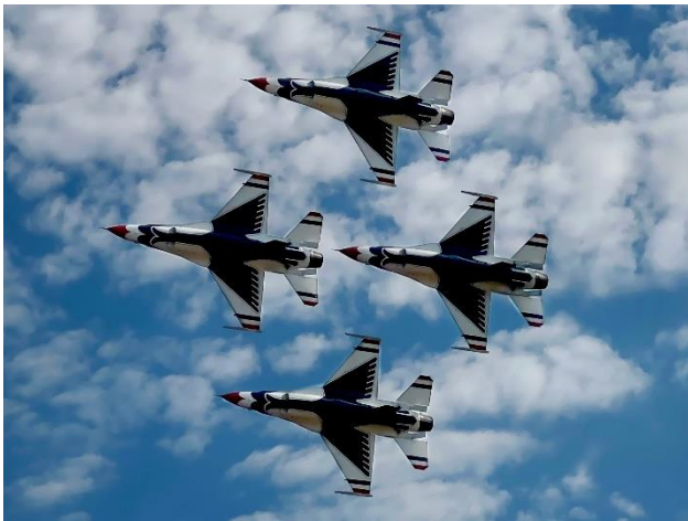
Air Force Thunderbirds

There were lots of displays, food, drinks, treats, and things to do as we waited for the air show to start. Although it was hot, there was very little wind, and it was a great time! There were great performers, but the Air Force Thunderbirds were definitely the highlight. Their precision flying is unreal!