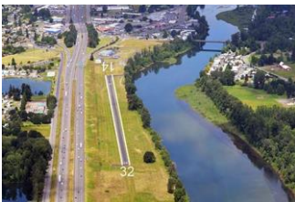
Woodland State (W27)

After postponing last time, on Saturday, May 15 we plan to fly to Woodland State Airport (W27) and walk into town for BBQ at Daddy D's. We'll depart in the 9:30-10:00 time frame and possibly get a touch and go in at PDX for those feeling adventurous.