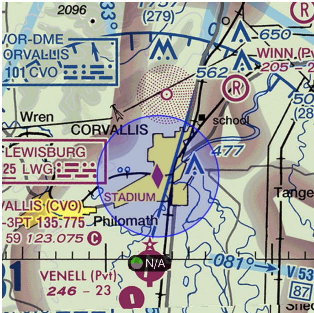
Upcoming stadium TFR (on 11/8) near KCVO, as displayed in Garmin Pilot

In the Valley, we can see these coming up in Corvallis and Eugene for football games. The TFR in Corvallis is about a mile from the approach end of runway 17. Please be aware of these TFRs and if you have to enter them, make sure you comply with the listed requirements. That usually just means you must have a transponder code and be talking to ATC. Getting flight following is a simple way to cover both those points.