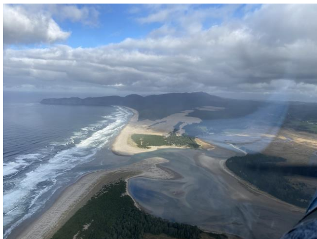
Morning flight conditions at the coast

We departed KSLE on a Saturday morning with broken/overcast skies in the 4000'-5000' range.