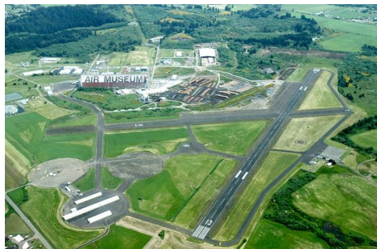
Tillamook Air Museum from the air

After a couple of cancelled fly outs, the weather