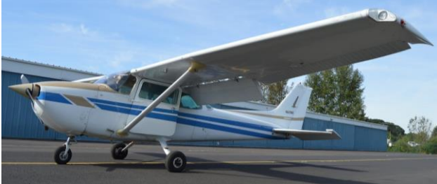
N5174E – Mikel Wynn

We are excited to announce that we've added a fifth aircraft to our fleet! N5174E is a 1978 Cessna 172N. 74E is IFR equipped with a Garmin GNS 430 (non-WAAS), TKM MX385 NAV/COM, Garmin audio panel, and Garmin GTX-345 transponder (ADS-B In/Out). The transponder can be paired to Garmin Pilot or Foreflight on your tablet or phone to display traffic and weather.