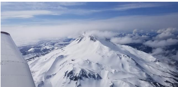
Mt Jefferson