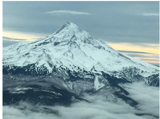
Mt Hood – Todd Lindley

Remember, maintenance for the club must be done by club authorized individuals. Regardless of whether you know how, or are even an A&P or IA, only approved shops are authorized to work on the aircraft. We need to ensure that proper maintenance is conducted, including logbook entries for all work performed, which is why only certain people and or shops are authorized to do the work. If you see an aircraft close to needing maintenance actions, please contact a board member and we will get it scheduled when needed.