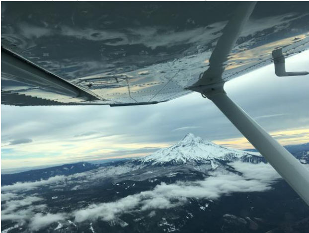
Mt Hood – Todd Lindley

For February, we will go for a common favorite and weather permitting hop over the cascades out to Bend for lunch at the Pickled Pig. Plan for Sunday the 17 th of February, leaving at 11:00 am. Hopefully the weather will be good enough, and we can make the hop over the mountains. It is a beautiful flight there over the snowcapped peaks, and the food is good!