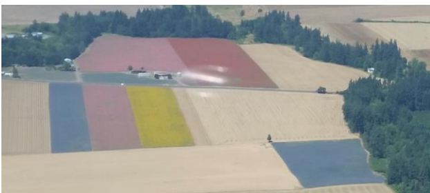
Colorful fields on the way to Mulino

Our July flight was diverted to Sisters (6K5) instead of Orcas Island (KORS) on July 21 st where lunch was had at the Sisters Meat and Smokehouse (about a 15 minute walk from the airport). A group also flew to Mulino for Oregon Pilot Associations annual blueberry pancake feed on July 14 th (talk about a fantastic breakfast!). There won't be an organized event in August, but members are strongly encouraged to get together and go to one of the events listed in the Upcoming Events section. Organizing an outing is as simple as sending an email to the entire club to see who is interested!