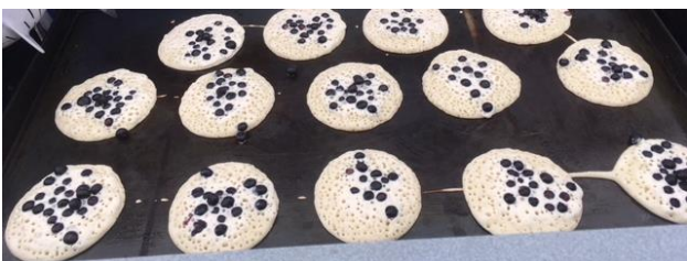
Blueberry Pancakes at Mulino – Todd Lindley