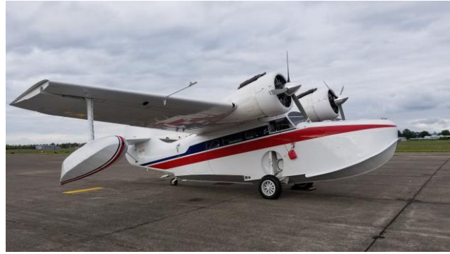
A visitor to Salem

One major benefit is that the flight portions can be spread across the two years. You could even incorporate that into your monthly hour of flying, and spread your flight review over a year. Check out the impressive library of courses the FAA has provided free to you, they will help with keeping your flight review current, and your knowledge sharp. The WINGS program can be found at www.FAASafety.gov.