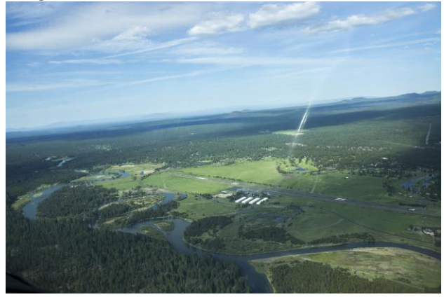
Sunriver Airport - Chris Eriksson

For May, we will do a fly out to Sunriver, and see if the weather is better this time around! We will plan to fly out and spend the day in Sunriver. It is a beautiful town with loaner bikes at the airport. The flyout will take place on May 12<sup>th</sup>, leaving at 9 am. Enjoy a stunning mountainous flight to eastern Oregon, and all the town has to offer!