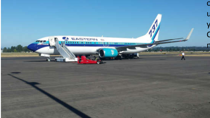
Ron Sterba noticed a visitor to Salem airport in a Boeing 737.

The south ramp has been closed now for construction. Remember to check your NOTAMS prior to each flight. While the south ramp is closed, the hangar row with 36H and 574 can still access the airport, but the aircraft must taxi directly in front of 5ED and 382s hangars. If flying 5ED or 382, please limit how much time you are parked in front of the hangar, as it blocks the only way in and out of the row. With this closure, taxiway C is closed. The currently preferred route to runway 34 is by Charlie-Juliet-Alpha-Foxtrot and crossing runway 34.